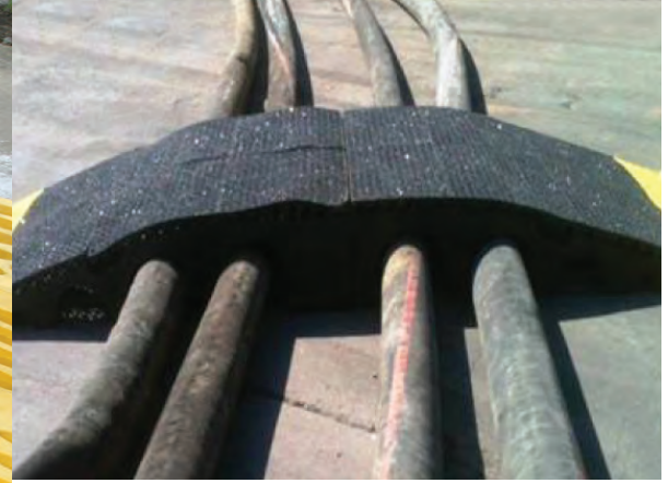
PICTURED: CHHBS IN USE (LEFT) CHWSHBS IN USE (TOP)

Checkers' Linebacker Cable Management offers the most extensive line of high performance cable/hose protection products in the world. These durable cable protection systems provide a safer method of passage for pedestrian traffic, vehicles and heavy duty equipment while protecting valuable electrical cables, cords and hose lines from damage.