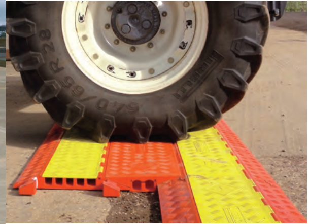
PICTURED: CL2X150-GD IN USE(LEFT) CL2X150-4/5 IN USE(TOP)

Checkers' Linebacker Cable Management offers the most extensive line of high performance cable/hose protection products in the world. These durable cable protection systems provide a safer method of passage for pedestrian traffic, vehicles and heavy duty equipment while protecting valuable electrical cables, cords and hose lines from damage.