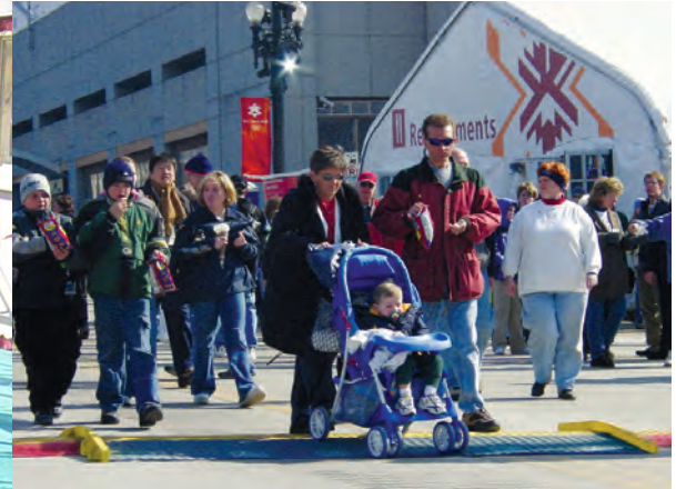
PICTURED: CPRP AND CPRL IN USE

Checkers' Linebacker Cable Management offers the most extensive line of high performance cable/hose protection products in the world. These durable cable protection systems provide a safer method of passage for pedestrian traffic, vehicles and heavy duty equipment while protecting valuable electrical cables, cords and hose lines from damage.