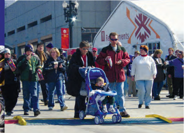
PICTURED: CPRP AND CPRL IN USE

Checkers' Linebacker Cable Management offers the most extensive line of high performance cable/hose protection products in the world. These durable cable protection systems provide a safer method of passage for pedestrian traffic, vehicles and heavy duty equipment while protecting valuable electrical cables, cords and hose lines from damage.