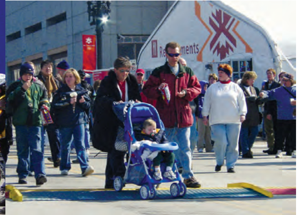
PICTURED: CPRP AND CPRL IN USE

Checkers' Linebacker Cable Management offers the most extensive line of high performance cable/hose protection products in the world. These durable cable protection systems provide a safer method of passage for pedestrian traffic, vehicles and heavy duty equipment while protecting valuable electrical cables, cords and hose lines from damage.