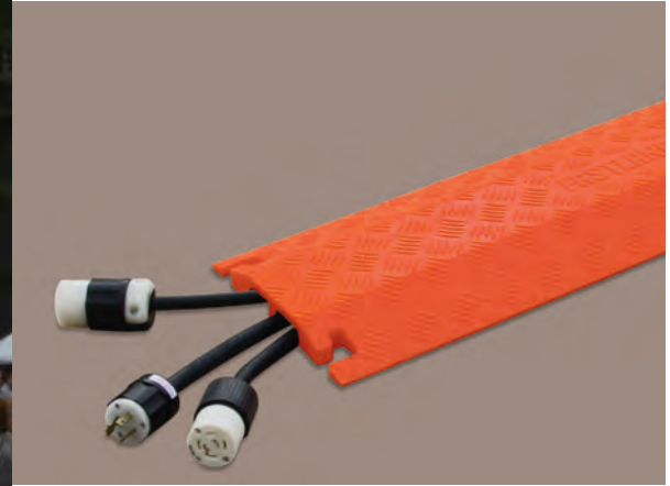
PICTURED: FL2X1.75 IN USE

Checkers' Linebacker Cable Management offers the most extensive line of high performance cable/hose protection products in the world. These durable cable protection systems provide a safer method of passage for pedestrian traffic, vehicles and heavy duty equipment while protecting valuable electrical cables, cords and hose lines from damage.