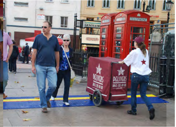
PICTURED: GD5X125-ADA IN USE (LEFT) HEAVY DUTY ACCESSIBILITY RAMPS IN USE (TOP)

Checkers' Linebacker Cable Management offers the most extensive line of high performance cable/hose protection products in the world. These durable cable protection systems provide a safer method of passage for pedestrian traffic, vehicles and heavy duty equipment while protecting valuable electrical cables, cords and hose lines from damage.