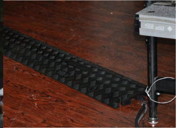
PICTURED: FL2X1.75 IN USE

Checkers' Linebacker Cable Management offers the most extensive line of high performance cable/hose protection products in the world. These durable cable protection systems provide a safer method of passage for pedestrian traffic, vehicles and heavy duty equipment while protecting valuable electrical cables, cords and hose lines from damage.