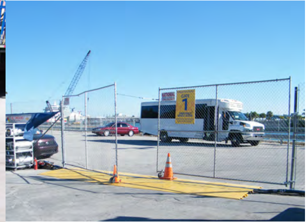
PICTURED: WSA-125-KIT3-HS IN USE

Checkers' Linebacker Cable Management offers the most extensive line of high performance cable/hose protection products in the world. These durable cable protection systems provide a safer method of passage for pedestrian traffic, vehicles and heavy duty equipment while protecting valuable electrical cables, cords and hose lines from damage.