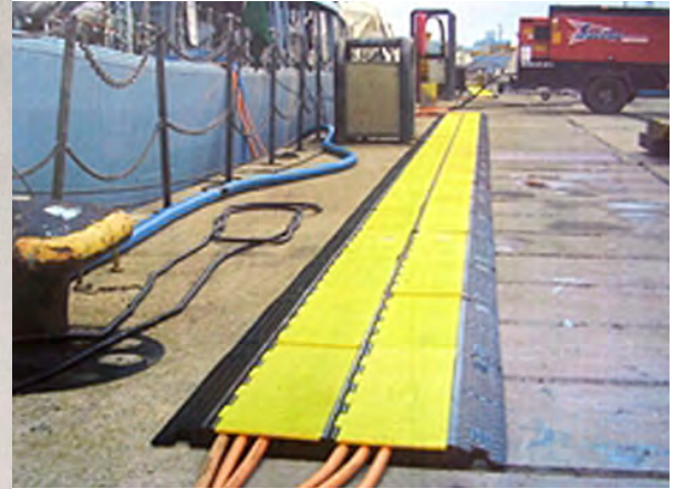
PICTURED: WSA-125-KIT3-HS IN USE

Checkers' Linebacker Cable Management offers the most extensive line of high performance cable/hose protection products in the world. These durable cable protection systems provide a safer method of passage for pedestrian traffic, vehicles and heavy duty equipment while protecting valuable electrical cables, cords and hose lines from damage.