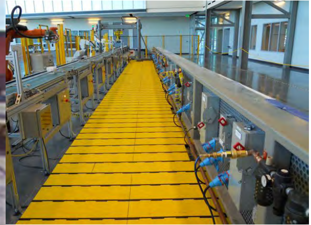
PICTURED: YJ5-125-AMS IN USE

Checkers' Linebacker Cable Management offers the most extensive line of high performance cable/hose protection products in the world. These durable cable protection systems provide a safer method of passage for pedestrian traffic, vehicles and heavy duty equipment while protecting valuable electrical cables, cords and hose lines from damage.