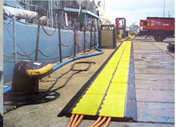
PICTURED: YJ5-125 IN USE)

Checkers' Linebacker Cable Management offers the most extensive line of high performance cable/hose protection products in the world. These durable cable protection systems provide a safer method of passage for pedestrian traffic, vehicles and heavy duty equipment while protecting valuable electrical cables, cords and hose lines from damage.