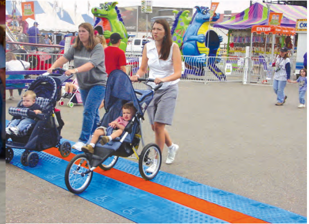
PICTURED: GD5X125-ADA IN USE

Checkers' Linebacker Cable Management offers the most extensive line of high performance cable/hose protection products in the world. These durable cable protection systems provide a safer method of passage for pedestrian traffic, vehicles and heavy duty equipment while protecting valuable electrical cables, cords and hose lines from damage.