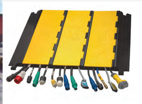
PICTURED: YJ5-125-AMS IN USE

Checkers' Linebacker Cable Management offers the most extensive line of high performance cable/hose protection products in the world. These durable cable protection systems provide a safer method of passage for pedestrian traffic, vehicles and heavy duty equipment while protecting valuable electrical cables, cords and hose lines from damage.