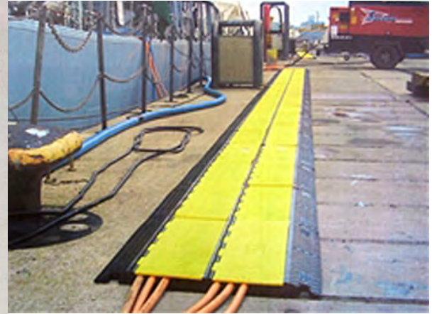
PICTURED: WSA-125-KIT3-HS IN USE

Checkers' Linebacker Cable Management offers the most extensive line of high performance cable/hose protection products in the world. These durable cable protection systems provide a safer method of passage for pedestrian traffic, vehicles and heavy duty equipment while protecting valuable electrical cables, cords and hose lines from damage.